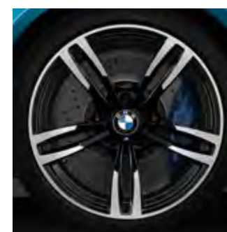
19" M Double-spoke style 437 M, Black