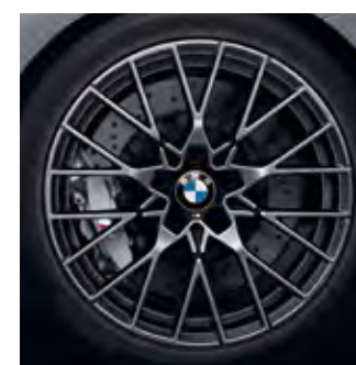
19" M Y-spoke style 788 M