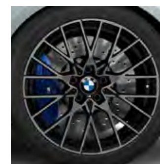
19" M Double-spoke style 788 M with Dark finish