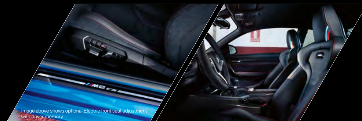
Image above shows optional Electric front seat adjustment with driver memory.